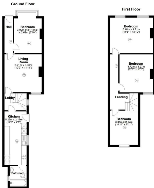
91 Warwards Lane, Selly Oak, Birmingham